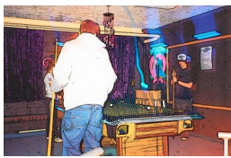
Teens enjoy playing pool at Catacombs

Catacombs featured various recreational activities including air hockey, ping-pong, pool table, PlayStation 2 game wall, an internet café, and a dance floor with deejay.