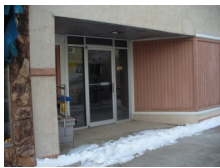
Front entrance to proposed facility for Catacombs

The need for a ministry like Catacombs is just as great today as when it first opened in 2003. Within the past year, Spencerville area pastors have been discussing how to tackle a number of challenges facing teens within our community. The